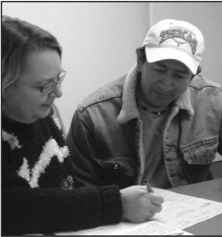
An ESOL Tutor and LCNV Learner work together.

Providing the Council with quarterly reports may be a chore for tutors, but reading them constitutes a treat for the tutoring programs' staff and placement advisors. It's great to receive the information we need regarding learners' instructional hours, not to mention updates on the materials being used with them, and the specific English skills on which their tutoring has focused. However, the best part is learning about students' progress towards their individual learning goals.